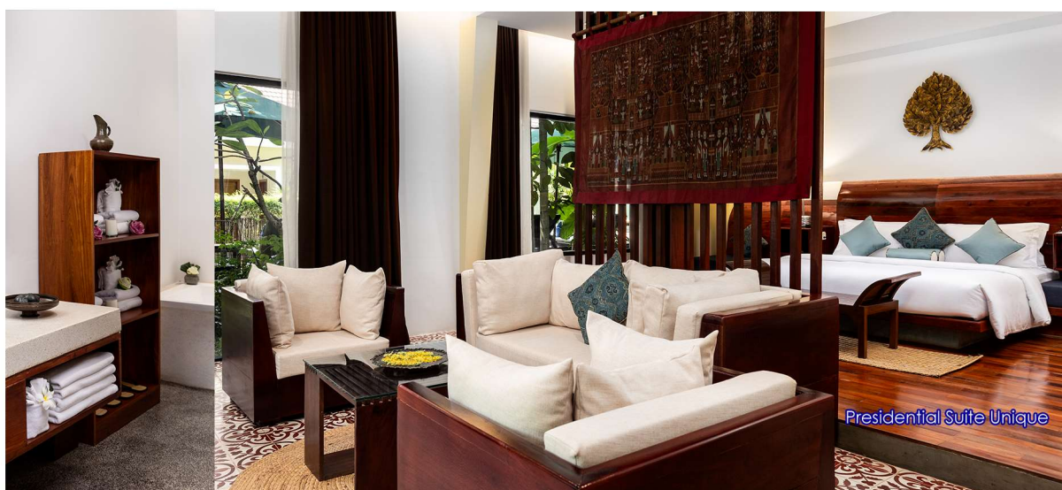
Presidential Suite Unique